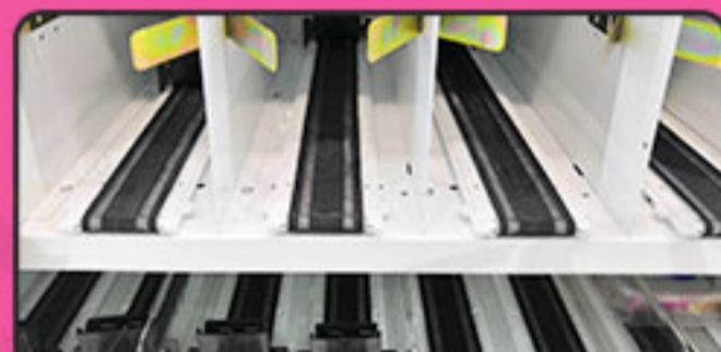
Conveyor belt slot